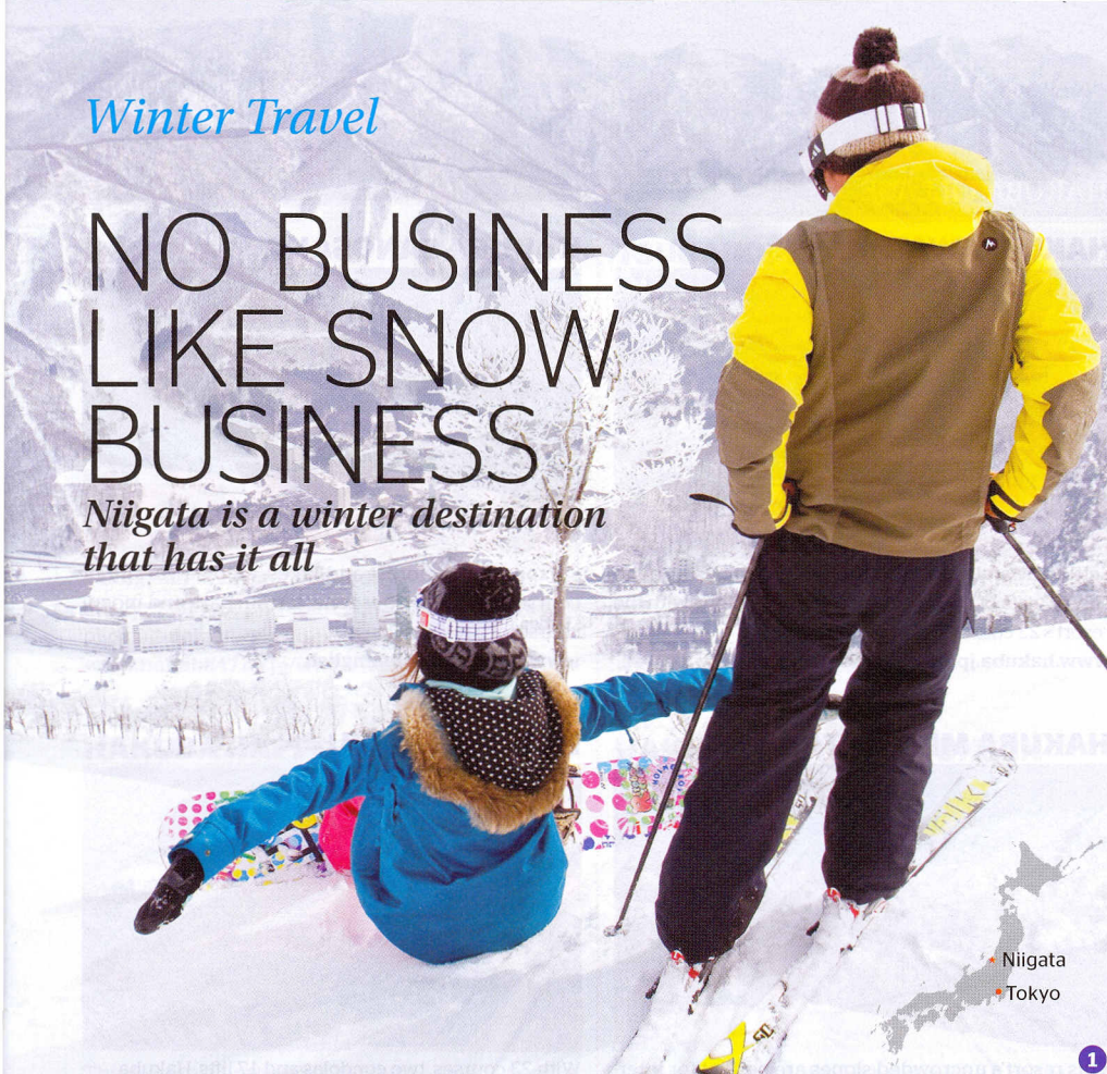
● Niigata ● Tokyo

Niigata is a winter destination that has it all